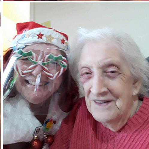
Christmas Day selfies