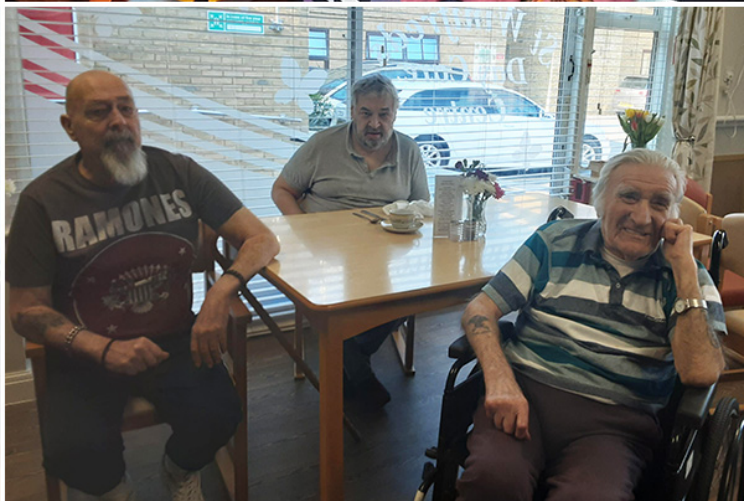
Having fun with music and crafts