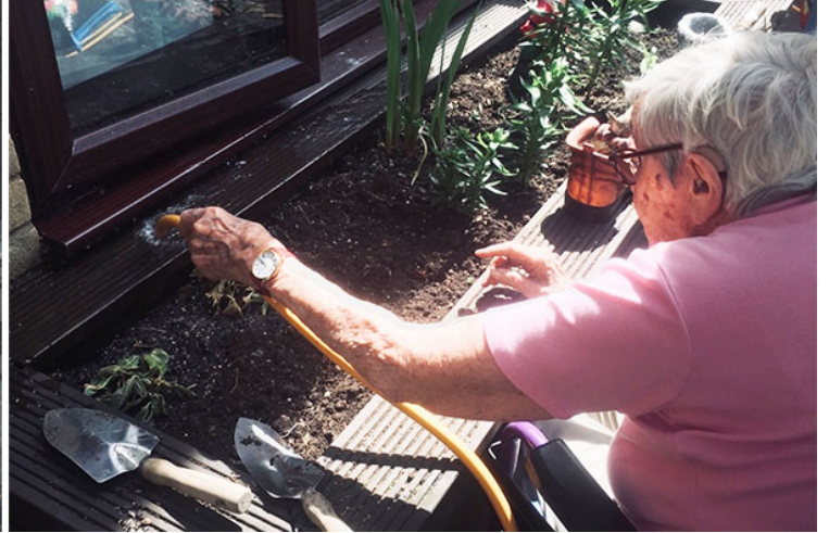
Our ladies enjoy gardening