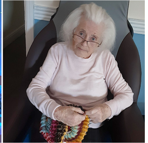
The LED light show creates a very relaxed vibe