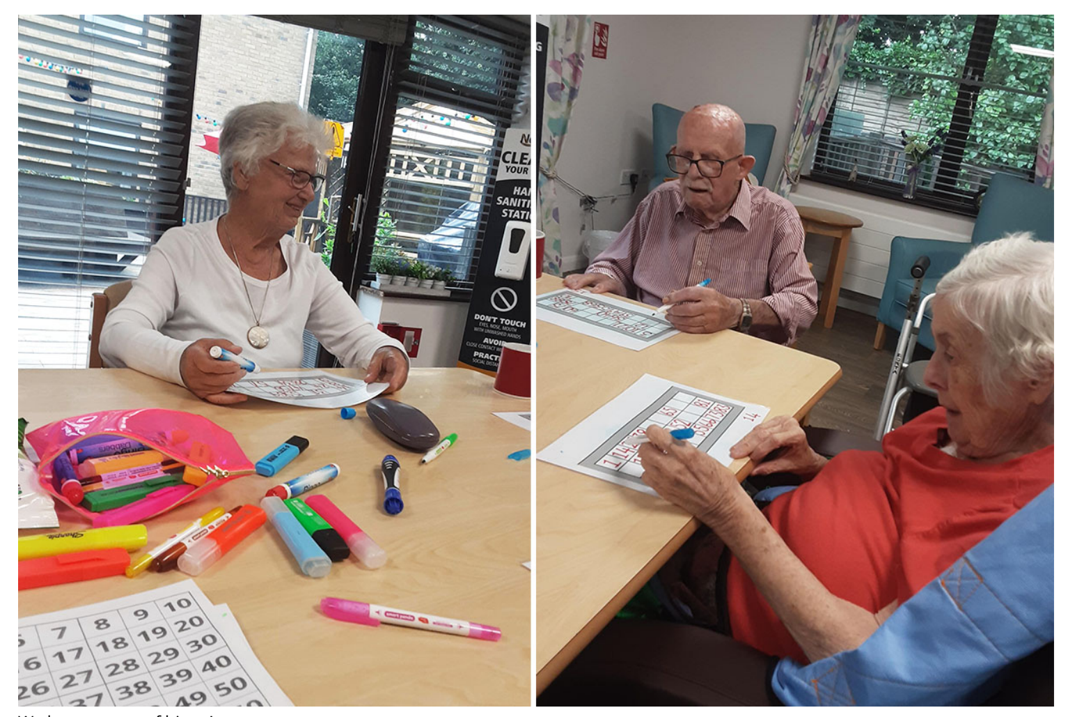
We love a game of bingo!