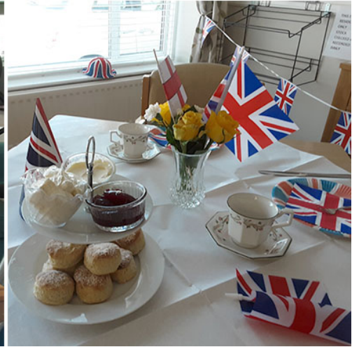
Our residents had the best time!