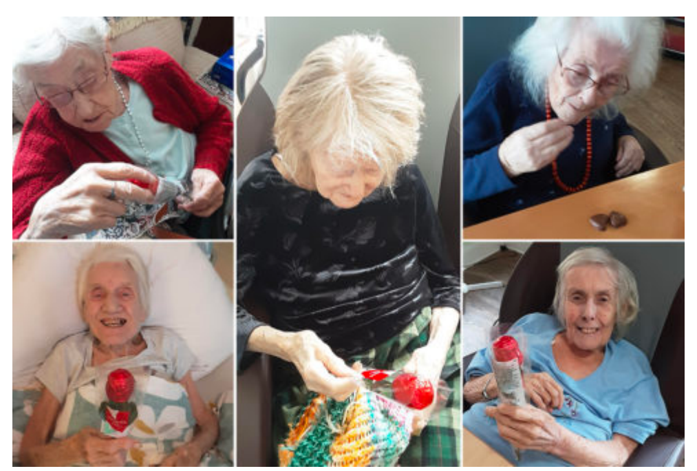
Our residents loved their chocolate roses!