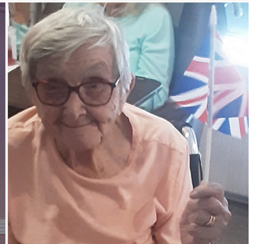
We were so excited to see the band play on Sunday 14 August