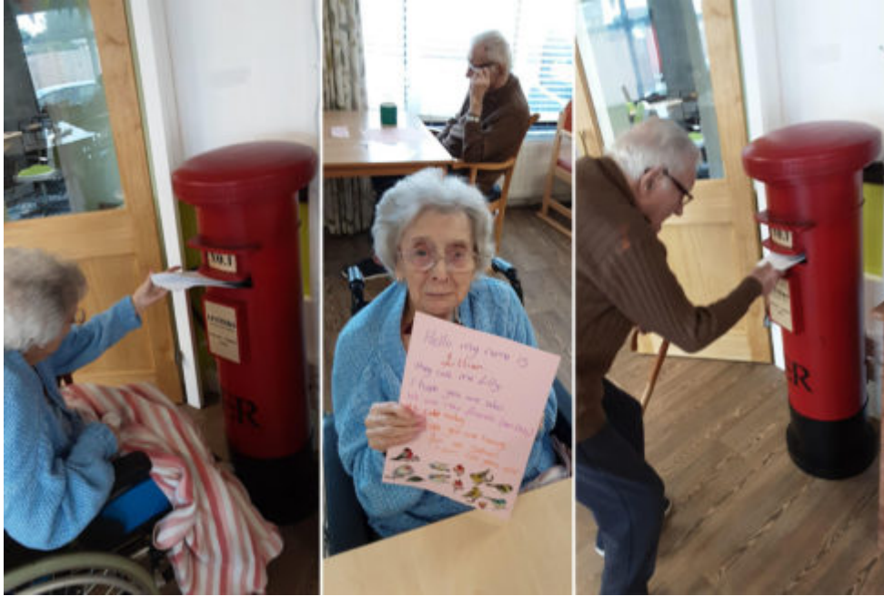
Posting their penpal letters